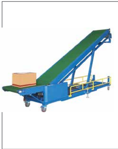
TRUCK LOADING BELT CONVEYOR