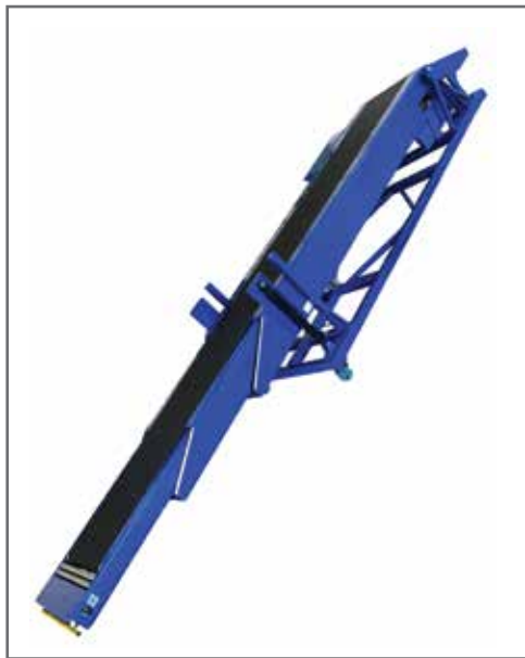
TELESCOPIC BELT CONVEYOR