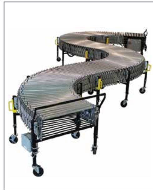
FLEXIBLE MOTORIZED ROLLER CONVEYOR

Our Customers / Channel partners are choosing top-quality service performance and complete support throughout the entire life cycle of their product. We are reliable, Capable & Affordable.